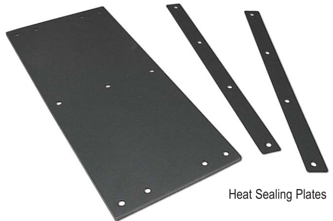
Heat Sealing Plates

This coating sees use for many types of heat sealing applications big and small.